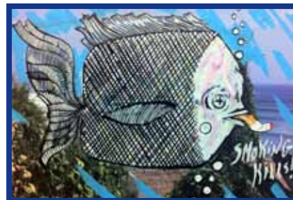
8 PXE, 27 × 19cm