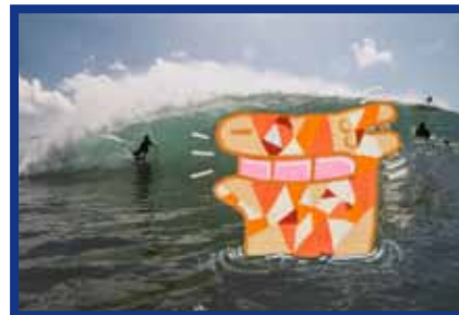
14 Gilbert, 35 x 24cm