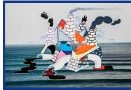
2 Gilbert, 27 x 19cm