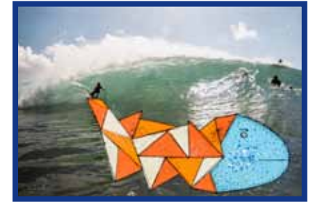
3 Quentin de Waele, 27 x 19cm