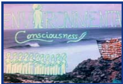
16 Cela Luz, 27 x 19cm