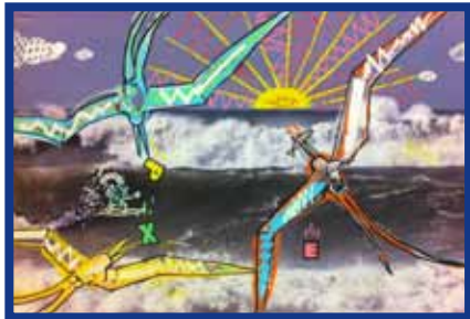
4 PXE, 27 x 19cm