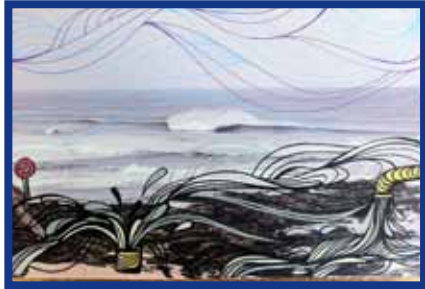
1 Bruno Big, 27 × 19cm