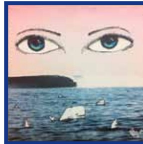
5 Pedro Gomes, 27 × 27cm