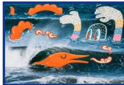
8 Gilbert, 27 x 19cm