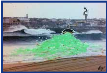
13 Cela Luz, 27 x 19cm