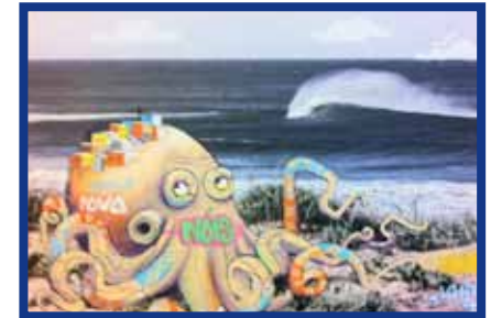
15 Acme, 27 x 19cm