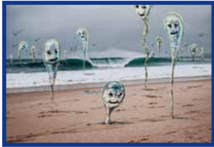
1 Jean Faucheur, 27 x 19cm