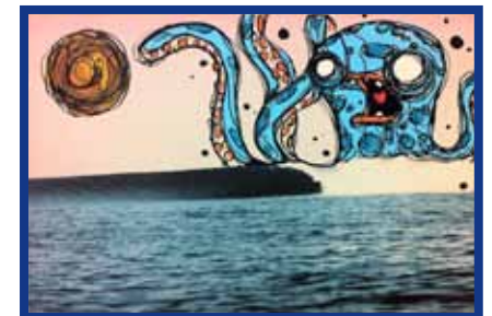
9 Rafo Castro, 27 × 19cm