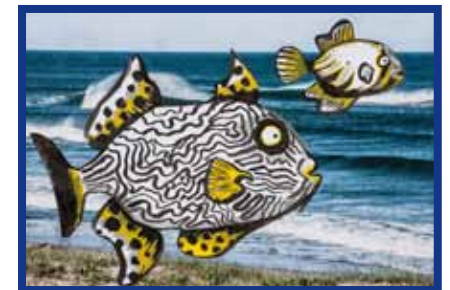
9 Rafael Suriani, 27 x 19cm