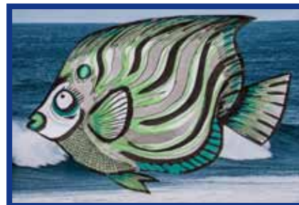
17 Rafael Suriani, 35 x 24cm