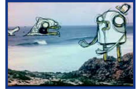
12 Rafo Castro, 27 x 19cm