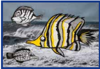
4 Rafael Suriani, 27 x 19cm