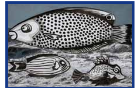
15 Rafael Suriani, 35 x 24cm