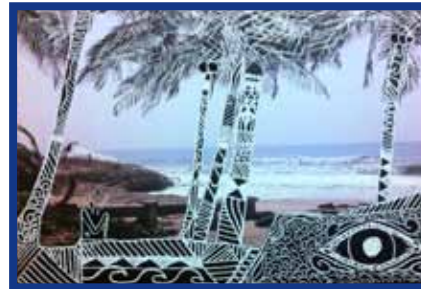
14 Pedro Gomes, 27 x 19cm