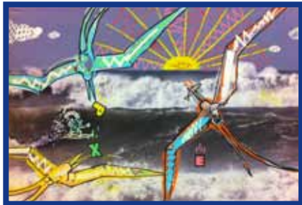
4 PXE, 27 × 19cm