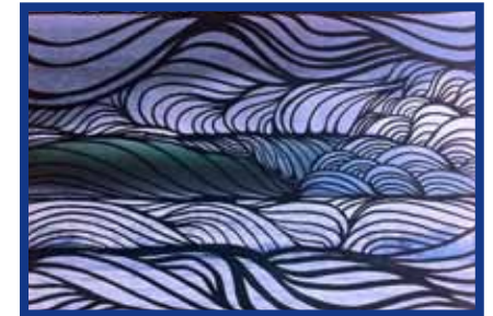
6 Bruno Big, 27 × 19cm