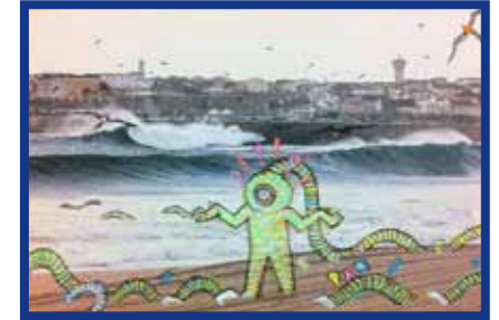
3 PXE, 27 × 19cm