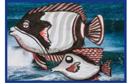
12 Rafael Suriani, 35 x 24cm