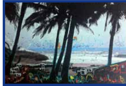
2 Marcelo Ment, 27 × 19cm